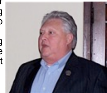
Rep. Jim Soletski